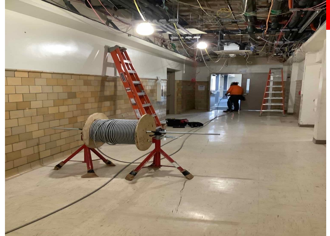
Electrical overhead rough-in