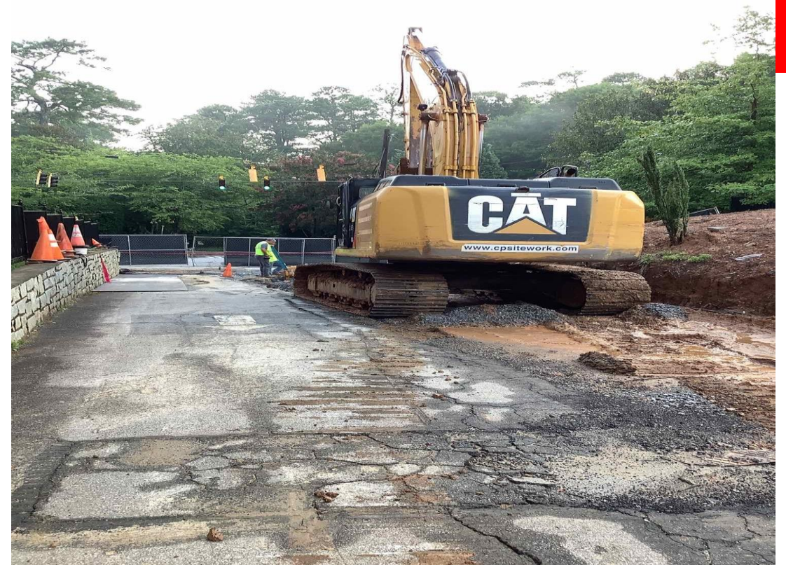
Site storm drainage line installation