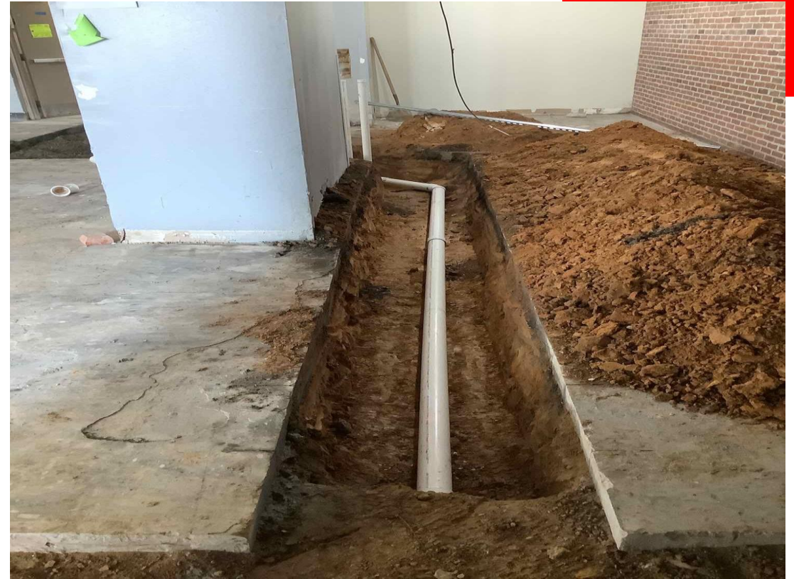
Underground plumbing rough-in