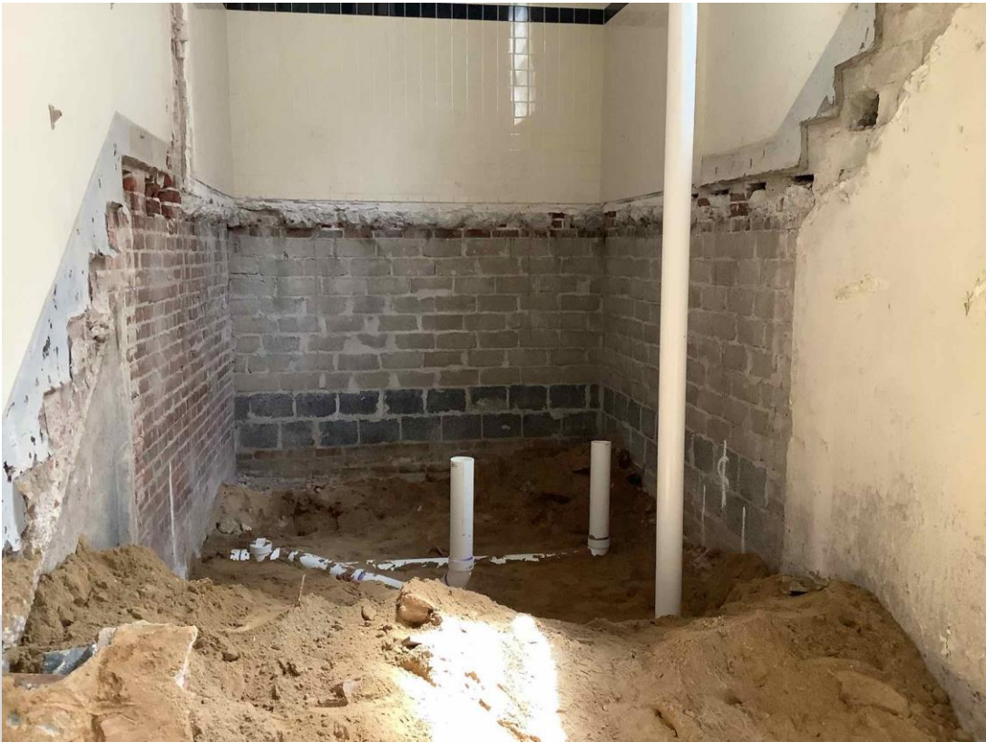
Underground plumbing rough-in