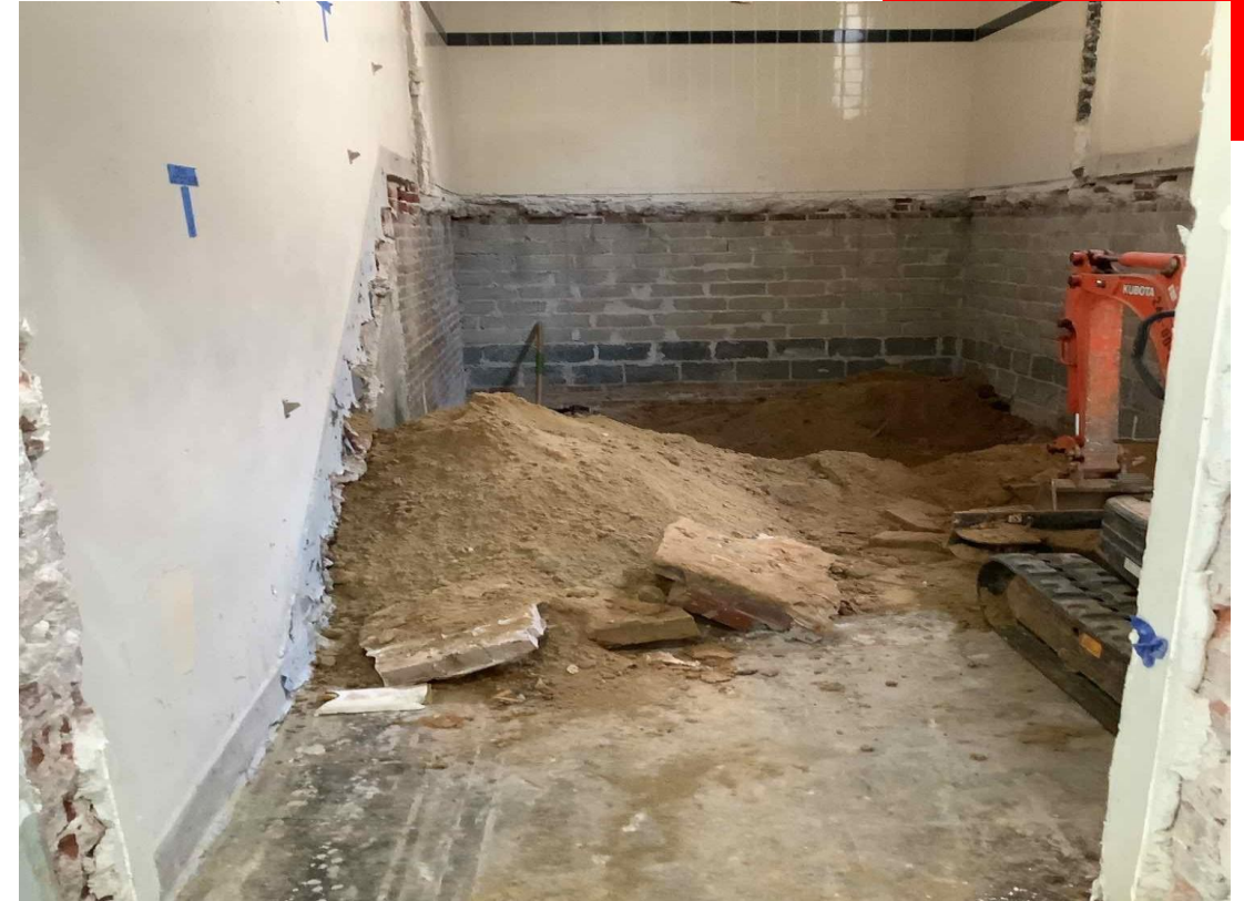
Selective slab demolition